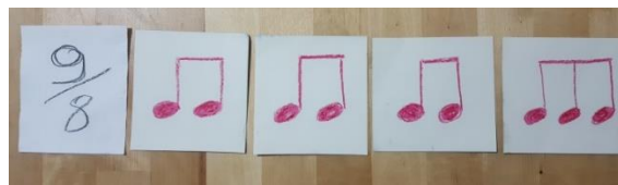
Figure2. A Sample Rhythm with Note Cards Used by the Students.

Figure 1. Subtext: There are 4 different cards in the figure that contain eighth note clusters. Three of these cards have two eighth note clusters and one has three eighth note cluster. These cards can be arranged in different ways during the game. In the asymmetrical rhythm structure, three eighth note cluster can be displaced. In this picture, three eighth note cluster is placed at the end of the measure.