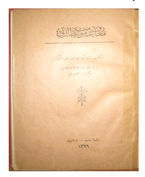
Appendix 2. Covers of 1913 and 1914 Primary School Curriculum