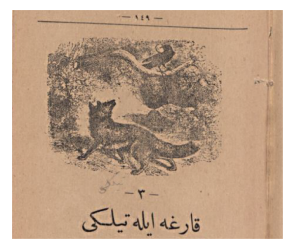
"Crow and Fox" (Source: Ali Seydi, 1916)