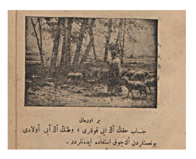
"Forest"