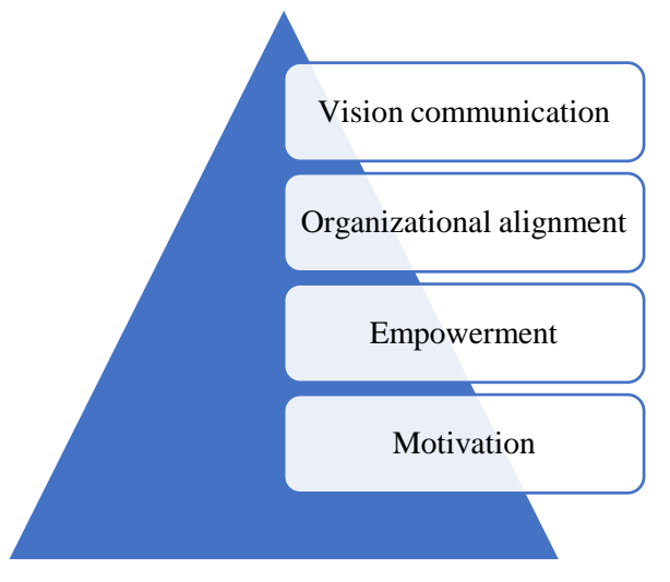
Figure 1: Vision realization factors

While forming a vision correctly is important, it is not sufficient on its own. The realization of a series of activities is even more crucial for the vision to become a reality. These activities, known as the realization factor of the vision, are illustrated in Figure 1.