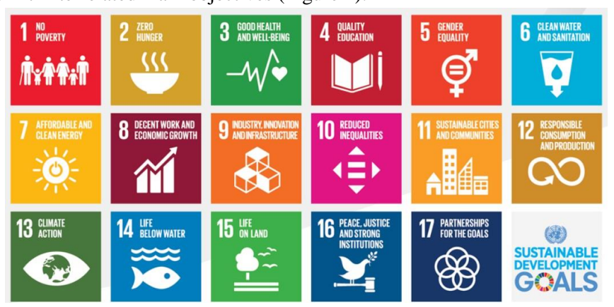
Figure 2. Sustainable development goals (United Nations, 2016)

Sustainability and sustainable development, while meeting the needs of today, necessitate taking into account the living conditions and environmental values of future generations, and creating healthy living environments for people in the environment-economy-technology relationship to be established to ensure this (McDonough, 1992). UNDP (United Nations Development Programme), the leading development agency of the United Nations, is working in more than 170 countries and regions to ensure that the goals targeted in line with the Sustainable Development Goals are achieved by 2030 (Özerdinç et. al., 2022). The Sustainable Development Goals, which entered into force in January 2016, consist of 17 interrelated main objectives (Figure 2):