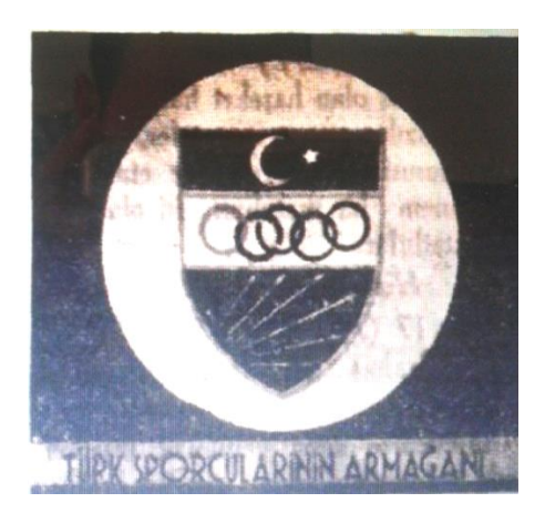
Figure 1.The emblem of the ruling party as it appeared on the gift cigarette packs presented by the Turkish Sports Association to the contenders.

another illustration of the fact that the CHP left its explicit mark on the sports of the era.