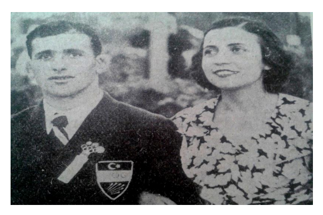
Figure 2. Mr. Yaşar Erkan, a successful athlete at the Olympics, wearing the badge with the emblem of the ruling Party.