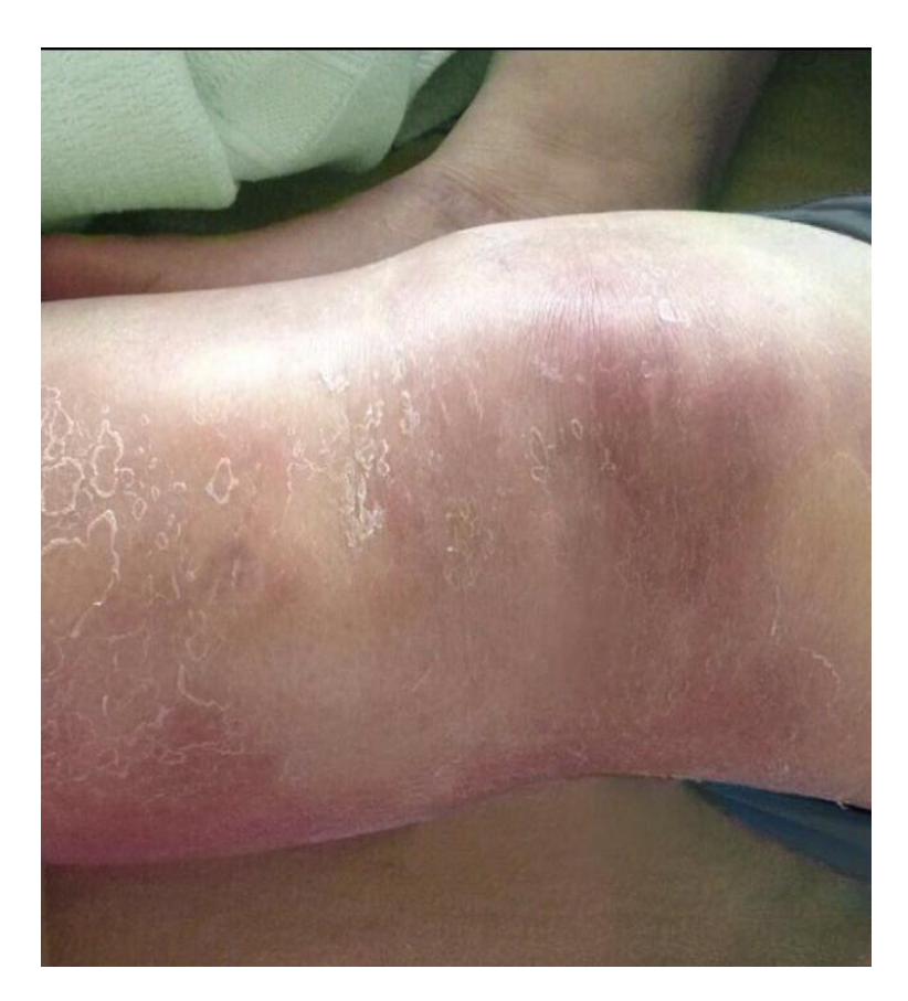
Figure 1. The erythematous lesion on leg towards 1/3 tibia proximal area

trauma history of having struck his knee on a rock in a fall and there had been contusion and a scratch on his right leg close to the knee. One day after the trauma, the patient experienced cold shivers with temperature close to 39° C and the abovementioned local symptoms developed. From the anamnesis taken from the patient it was learned that he was not using any antibiotics for his symptoms. There was a 10-year history of diabetes mellitus with blood sugar level regulated by insulin.