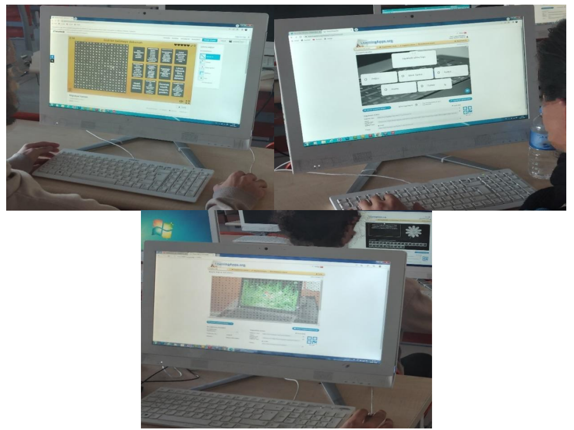
Figure 2. Some visuals of the implementation process

researcher and students. Rich descriptions were made and the special characteristics of the circumstance were stated for external validity. For credibility, the researcher clearly described his or her position and role in the study and provided thorough explanations of each stage of its development in accordance with a predetermined system (Yin, 2013). In the study, the consistency was ensured by taking the opinions of different experts in determining the themes and codes.