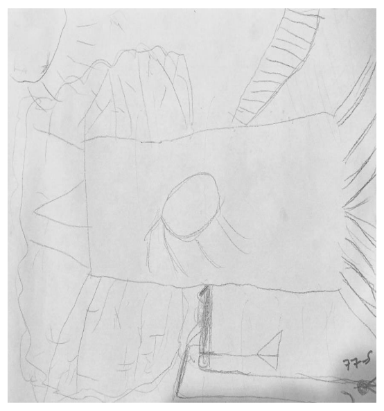
Figure 3. A sample picture from students' final drawing

"A reel is installed on a tree; some load is being carried. The use of science in daily life is shown. An association is made."