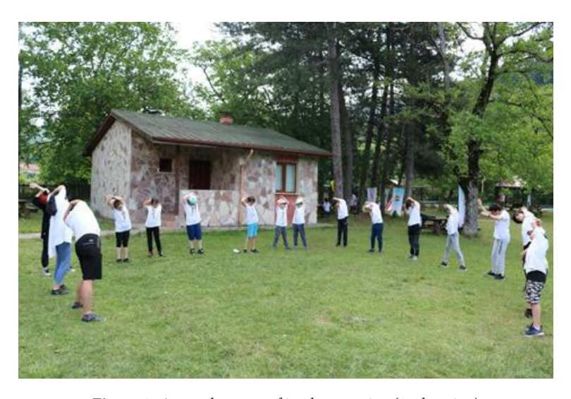
Figure 1. A sample center of implementation (1st location)