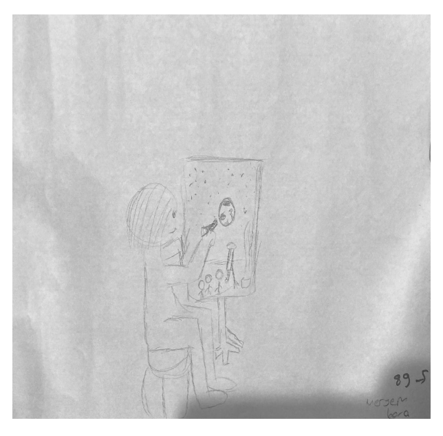
Figure 4 . A sample picture from students' final drawing

"A kid depicting the nature is drawn. There are two more concepts in that picture. Sky observation is described with a telescope and the stars. A kid artist who wants to explain the art of nature and science in nature is drawn."