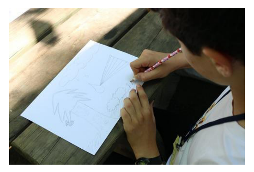
Figure 2. A sample picture from the data collection process

Students were informed that they could draw wherever they wanted (table, dining area, park, green zone, etc.) within the safe borders of the implementation area so that they could express their thoughts better and not affect each other. Following the final drawings, semi-structured interviews were held with 10 students randomly selected among the volunteers. Students' views and definitions of the concepts of science and nature were inquired about in the interviews. The semi-structured interview form was developed by the researchers, and its validity was ensured by expert opinion. For the interview to be appropriate for the student's age, the number of questions and the duration were restricted. The interview form comprised of 5 questions intended to reveal the participants' perspectives on science and nature.