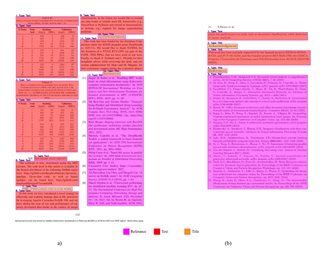
Figure 3. (a) Segmentation and text classification results for last pages and (b) an example.

Due to its nature, an academic publication consists mainly of text blocks. These text blocks are divided into classes within themselves. Separating these blocks of text from one another is often quite a difficult task. Reference pages are given in Figures 3a and 3b as examples. The presence of different reference systems makes success here difficult. Although NLP methods are used to separate a reference block from a list or a regular paragraph structure, this is a still a monumental task.