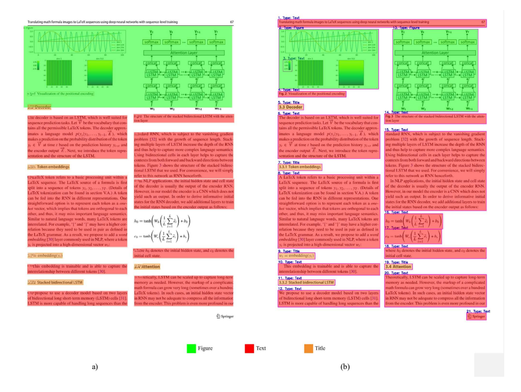
Figure 4. (a) Comparison of the LayoutParser Result and (b) the Developed Application Result.

For the comparison process, making a comparison of a document classified as a middle page will be appropriate because the text classes for the documents classified as first and last pages in the developed application were unique. Figure 4b shows a comparison of the system developed in the study with the results of the LayoutParser model used in Figure 4a.