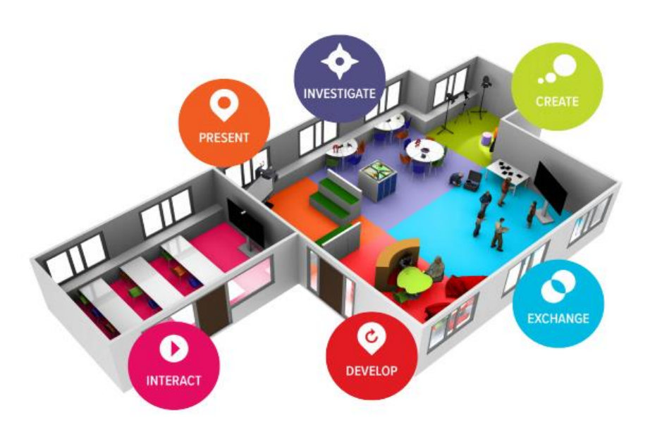
Figure 2. The design of the Future Classroom Lab, incorporating six learning zones (Ayre, 2017, p.12)

The FCL, which resonates with inquiry and project-based learning strategies to a great extent, stands out with six zones in the classroom design. It offers a flexible learning environment, including innovative learning approaches, thereby creating an open culture and inspiring other learning environments (Ayre, 2017). Similar to the FCL model, various approaches and metaphors began to be incorporated into school designs (See, Thornburg, 2004). For instance, the Federation University in Australia metaphorically defines the learning zones