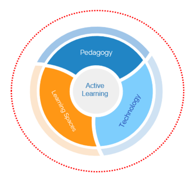
Figure 1. The main components of new classrooms (Adapted from Steelcase Education, 2014)

The FCL is based on "the design of learning spaces" that allows students to gain and improve 21st-century skills by dividing the classroom into six different learning zones: create, investigate, develop, interact, exchange, and present (Ayre, 2017). These six zones are structured explicitly in a classroom environment, and teachers guide the process of learning in the zones suitable for students' learning experiences. In these classrooms, "pedagogy" and "technology integration" are the other main components of FCL. Any kind of technological tool and educational activity that is not supported by the appropriate pedagogy can be a waste of time. Therefore, it is a must to build consistency among "the learning spaces, pedagogy and the integration of technology" for active learning in the future classroom (YEGITEK, 2018), as shown in Figure 1.